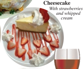
Cheesecake With strawberries and whipped cream