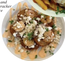
Fried Green Toms Topped with blackened shrimp, feta and firecracker sauce