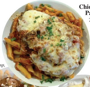
Chicken Parmigiana Topped with marinara and mozzarella cheese